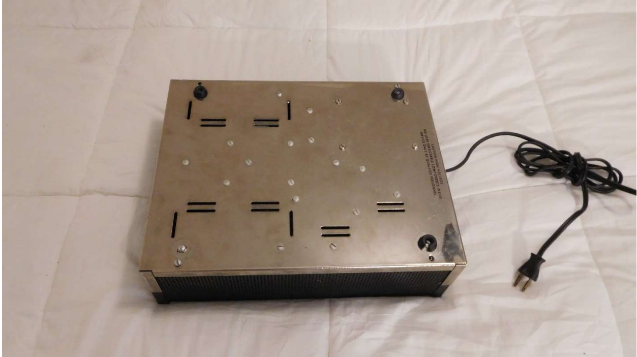
Needs new feet.