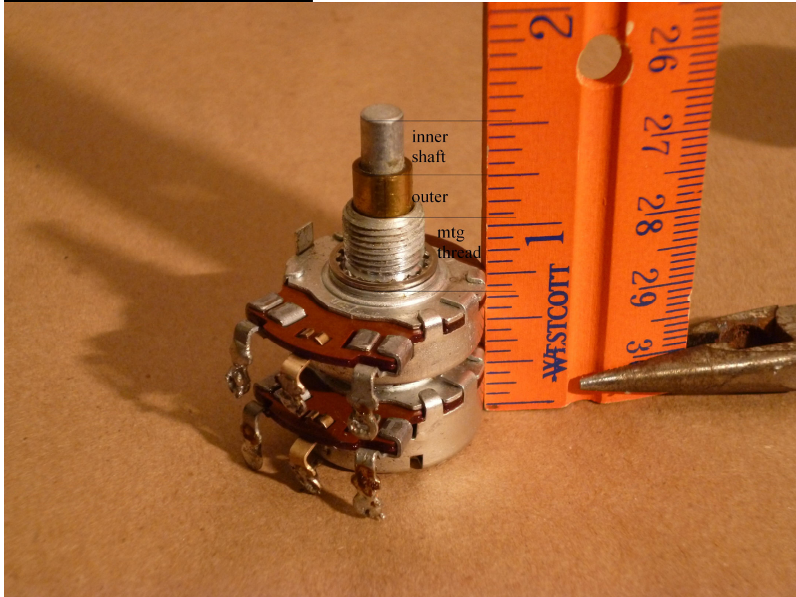
Figure 2 – Physical dimensions of the PAT-4 bass control Inner shaft length (silver colored shaft above brass colored outer shaft) – 0.25” Outer shaft length (brass colored shaft above mounting threads – 3/16” Mounting threads length – 0.25” Overall length from body mounting flange to inner shaft end.- 0.75”