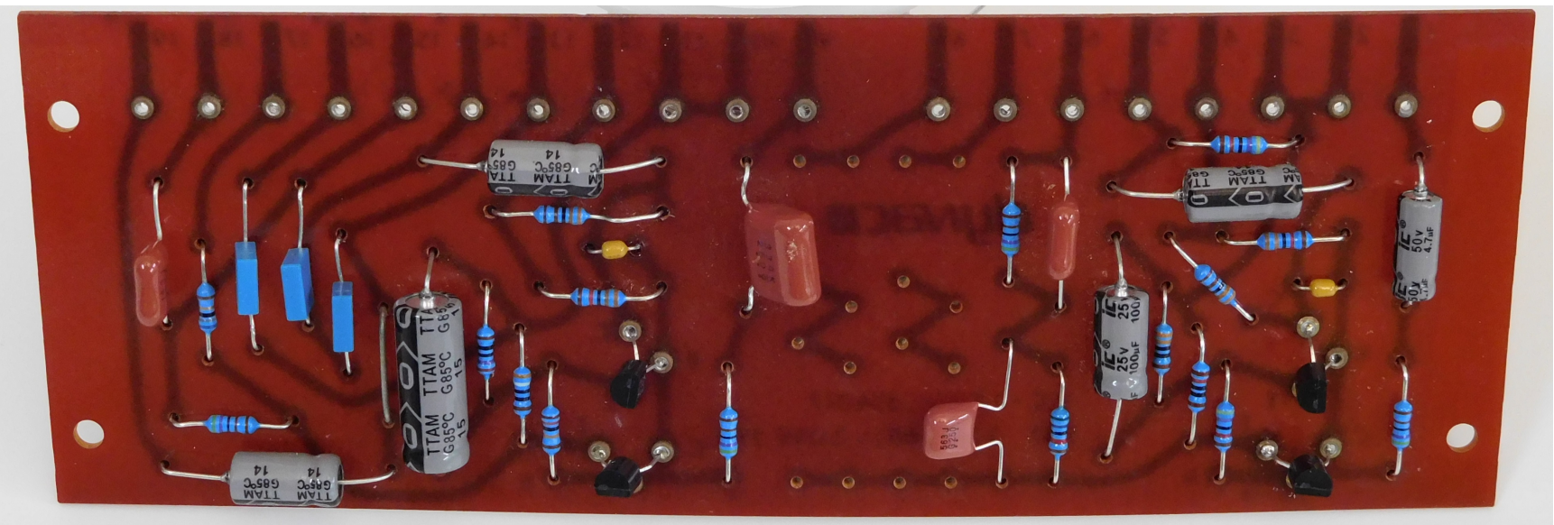
Figure 4-Stock PCB (after upgrade)