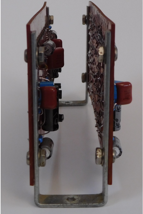
Figure 1-Both PCBs reassembled onto U brackets, ready for installation