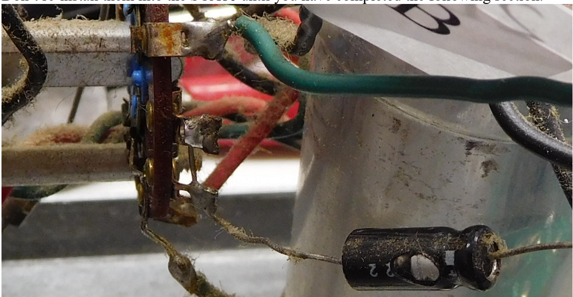
Figure 2-Showing connection of original C14 negative end to terminals 3 and 4 of the selector switch

Attach the PC boards to the U-shaped bracket. Use the original 4-40 screws and nuts. Don't re-install them into the SCA80 until you have completed the following section.