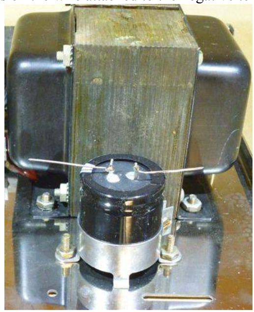
Figure 4 – solder "antenna-like" wires to terminals of C11 to facilitate the connection of the power supply and amplifier wires.