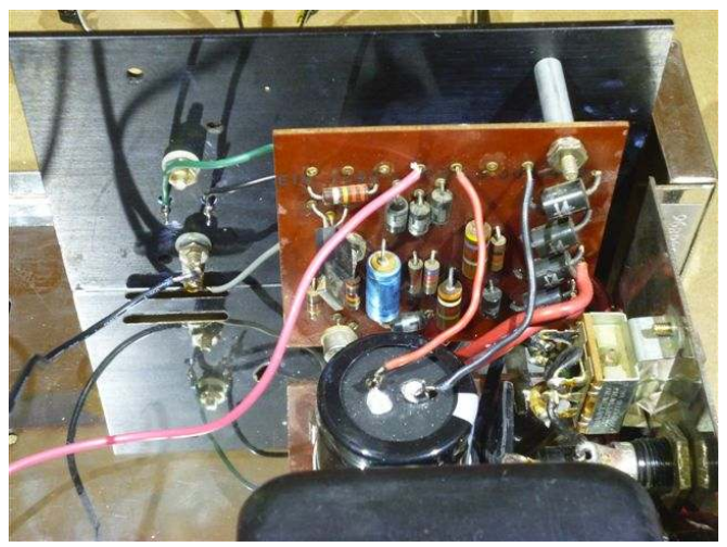
Figure 3-showing the new C9 installed.