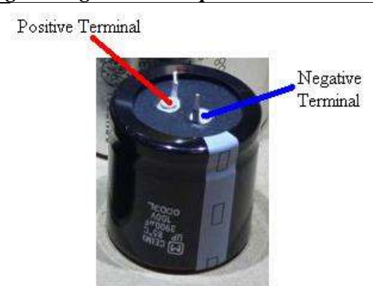
Figure 2-Identifying the positive and negative terminals

Be careful about the capacitor polarity! Check it twice, then check it again. If you get this wrong, the capacitor will be damaged, throwing hot aluminum foil with impressive force. The negative signs on the capacitor mark the negative terminal.